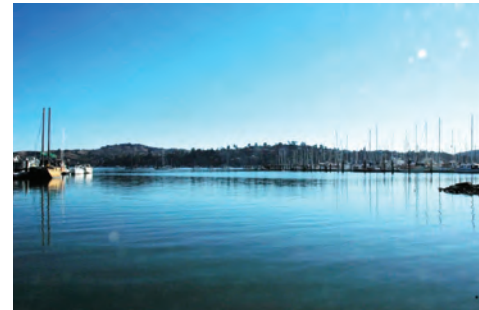
VIEWS FROM THE DECK