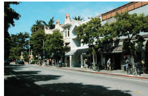
PARADISE BAY IS MINUTES AWAY FROM DOWNTOWN SAUSALITO